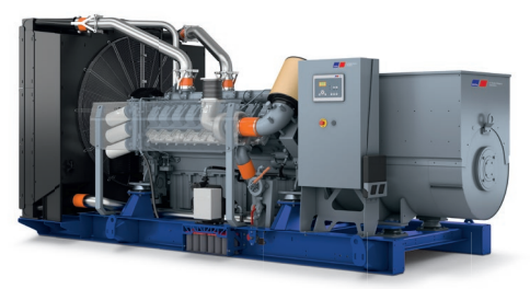
Optional equipment and finishing shown. Standard may vary.